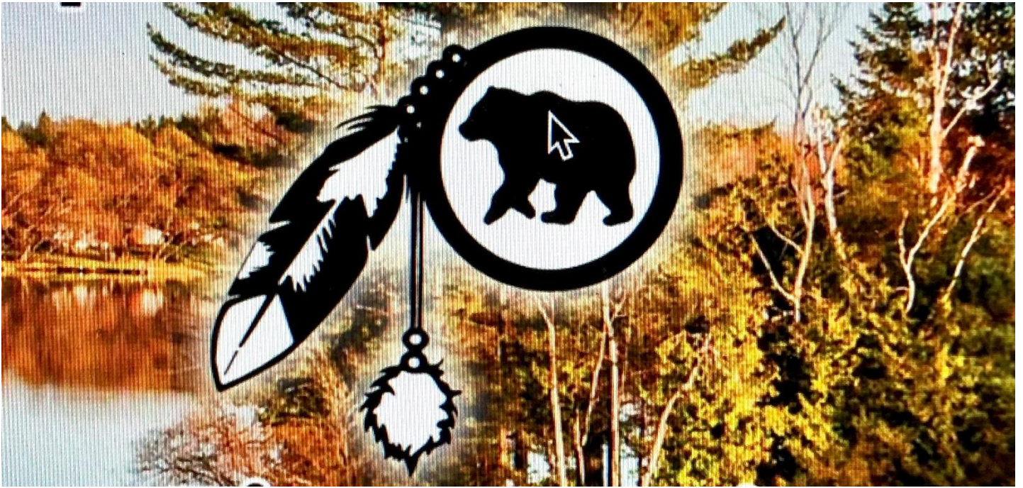
Algonquin's of Pikwakanagan.